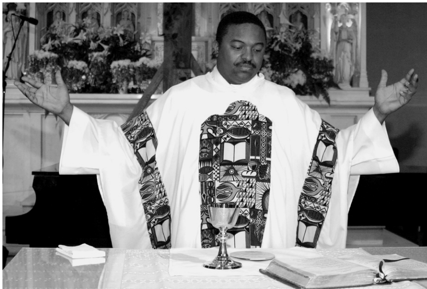
White vestments denote special times of celebration in the life of Church such as Easter and Christmas

The Church calendar has always revolved around the celebration of Easter and the